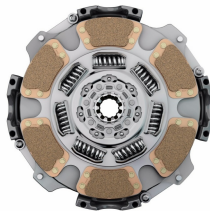
IMAGE IS FOR PART ILLUSTRATION PURPOSES ONLY SEE ITEM DESCRIPTION, FEATURES AND NOTES FOR ADDITIONAL PART SPECIFIC DETAIL